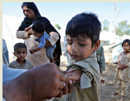
Malnutrition impairs vaccine efficacy.

Lack of proper nutrition opens the door to disease. “Malnourished individuals have reduced immunity, and thus vaccines are less effective,” says Somen Nandi of