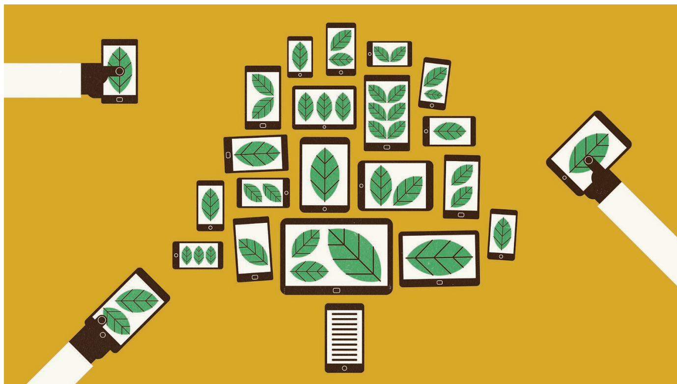
ILLUSTRATION BY THE PROJECT TWINS

Scientists are turning to a software-development site to share data and code.