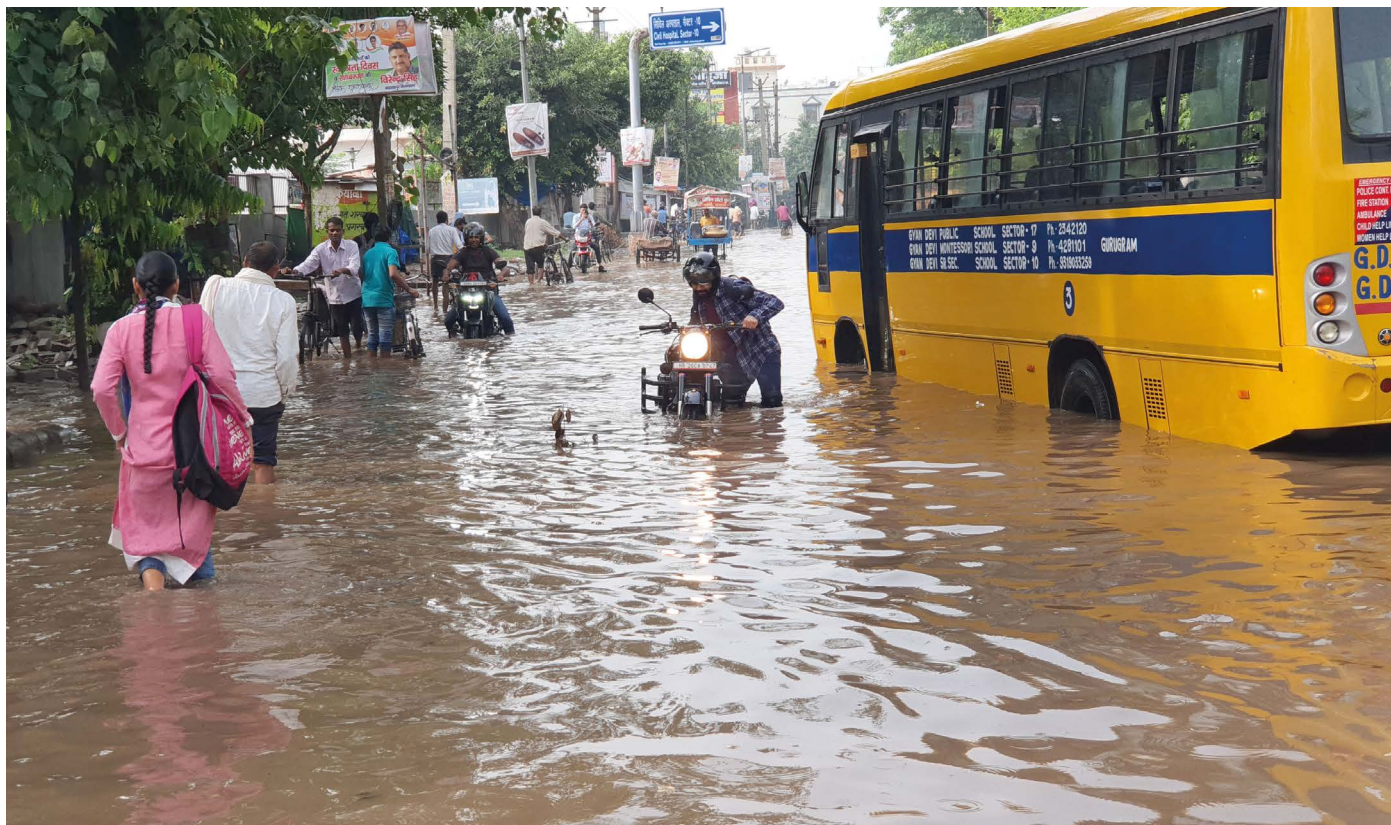
Floods similar to this one at Gurugram in August are becoming more common in India.