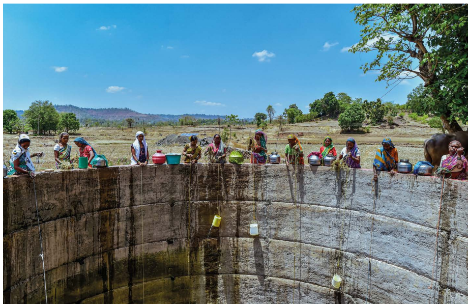
Women in Maharashtra state draw water from a well that is almost empty.

factors that leave the Indian population with little protection. For example, in a heatwave, someone who can remain indoors with a cooling system is much less exposed than is a street vendor who needs to work outside – but fewer than 10% of Indians own air-conditioning. Furthermore, India's booming population will place further demand on food and water, and the sheer number of people living in vulnerable areas (particularly in coastal regions) will rise, meaning climate change will take an even greater toll.