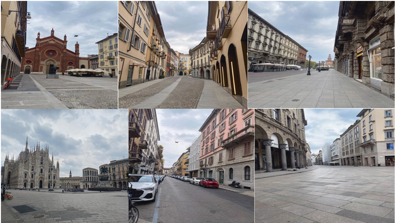
Fig. 1 The empty center of Milan, March 30, 2020, 3 p.m. Panels (clockwise) represent the “Milano Brera fashion district” (1,2,3,4,5) and Duomo Square (6), respectively.