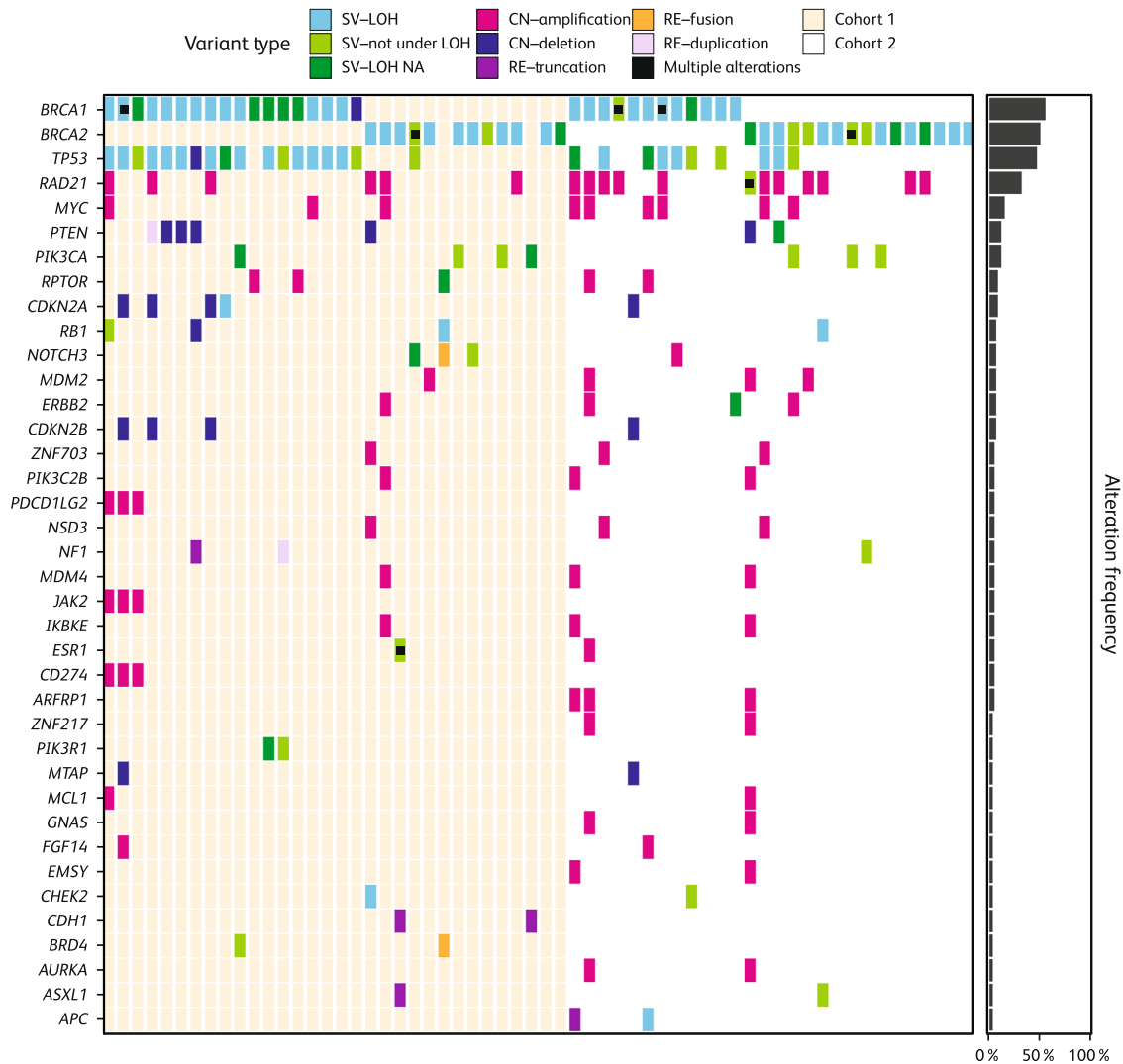
Fig. 1 Tumor known/likely pathogenic variants detected in ABRAZO 1 . 1 Known/likely pathogenic variants per FoundationOne ® CDx test are shown (genes altered in >1 patient are plotted). Those patients with multiple alterations in a gene are indicated by (■) and if one of the alterations is LOH, the square is colored as LOH. For rearrangements, if a partner gene was present, both genes were labeled. CN copy number, LOH loss of heterozygosity, NA not available, RE rearrangement, SV short variant.

five had BRCA LOH, one did not exhibit BRCA LOH, and one was not evaluable for BRCA LOH (Supplementary Table 1).