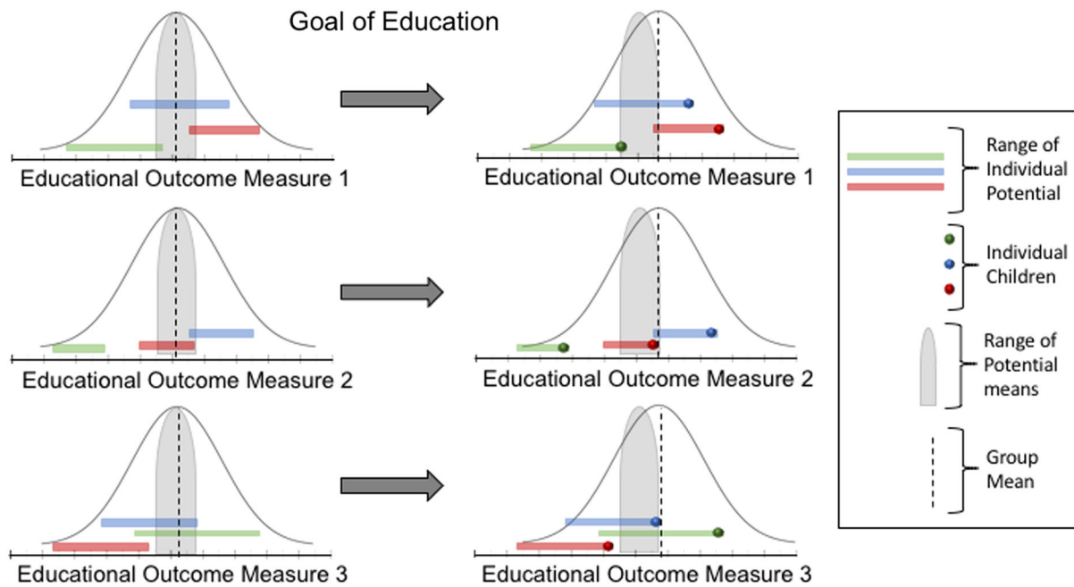
Fig. 2 The left side of this figure depicts normal distributions of three educational outcomes measures. Individual children each have a range of scores that they may be predisposed to fall within. Ranges of three example individual children are highlighted in green, blue, and red. A hypothetical range that represents the extent to which the mean of the distribution can shift is highlighted in gray. A goal of education could be to help each child achieve the maximum score within their own individual range on these particular educational outcome measures. The right side of the figure depicts the scores of the three children and the group mean of the population if this goal of education is achieved. The educational outcome scores for the three example children are depicted with circles at the right end of each child's range of individual potential. The dotted line on the right represents where the group mean would fall if all children achieved their maximum potential score