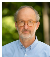
Tillman Gerngross, Dartmouth College.

historical reliance on Chinese hamster ovary (CHO) cell manufacturing, and therefore high-value (tens of thousands of dollars per infusion per patient), high-impact markets are preferred. This manufacturing and pricing model is not well aligned with infectious disease, where very large numbers of doses may be required and are expected/need to be relatively affordable due to community expectations around costs of antivirals and antibiotics.